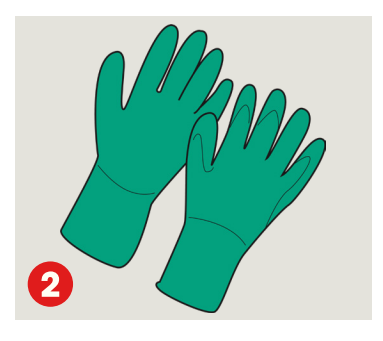
Use appropriate PPE as indicated in the safety data sheet.