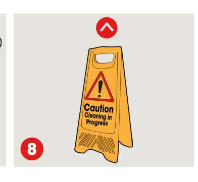
Remove safety signs.