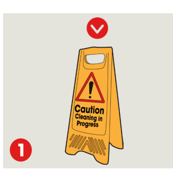
Place safety Sign.